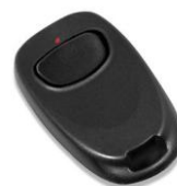
Single Button Emergency Call with LED Light

Alert buttons can be placed in high-traffic areas of the home